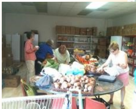
Volunteers clean and sort all produce before it is placed in the boxes.

As part of our sustainable foods program, Feed Fannin began supplying the Food Pantry with dozens of fresh eggs each week. We started with 60 dozen and are now supplying 90 dozen every week.