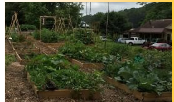
Left photo - Some of the allotments earlier in the year. Photo below - Bountiful allotment gardens

Many members are interested in keeping their gardens growing for as long as possible and will renew their membership next year. However, there will be available allotments if anyone is interested in renting one next year. Please contact Catherine Sugg at cksugg@aol.com .