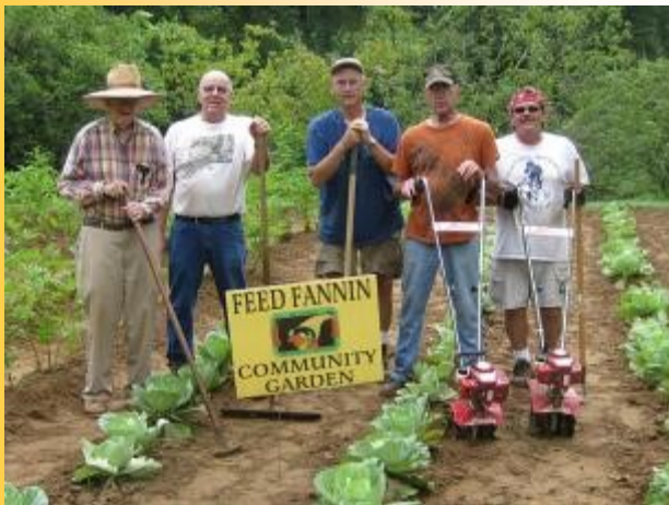
The hard working Forge Mill volunteer garden crew